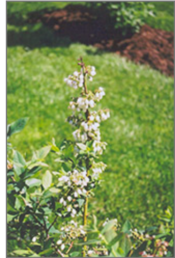
Elliott Blueberry flowers

This shrub is typically grown in a designated area of the yard because of its mature size and spread. It does best in full sun to partial shade. It does best in average to evenly moist conditions, but will not tolerate standing water. It is very fussy about its soil conditions and must have sandy, acidic soils to ensure success, and is subject to chlorosis (yellowing) of the foliage in alkaline soils. It is quite intolerant of urban pollution, therefore inner city or urban streetside plantings are best avoided, and will benefit from being planted in a relatively sheltered location. Consider applying a thick mulch around the root zone in winter to protect it in exposed locations or colder microclimates. This is a selection of a native North American species.