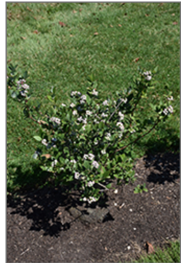
Elliott Blueberry fruit