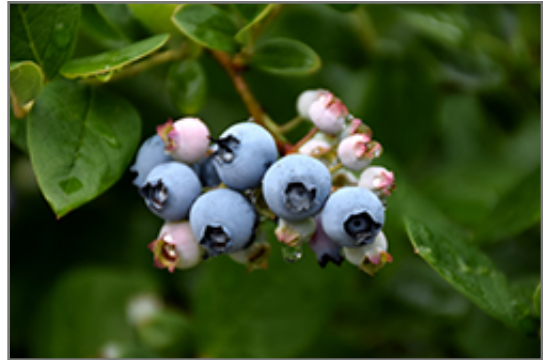
Elliott Blueberry fruit

Elliott Blueberry features dainty clusters of white bell-shaped flowers with shell pink overtones hanging below the branches in mid spring. It has green deciduous foliage. The glossy oval leaves turn yellow in fall. It features an abundance of magnificent blue berries from late summer to early fall. The smooth brick red bark adds an interesting dimension to the landscape.