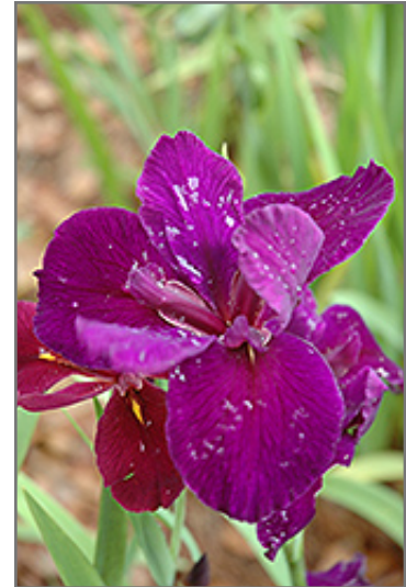
Jeri Iris flowers