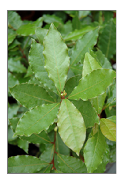
Bay Laurel foliage