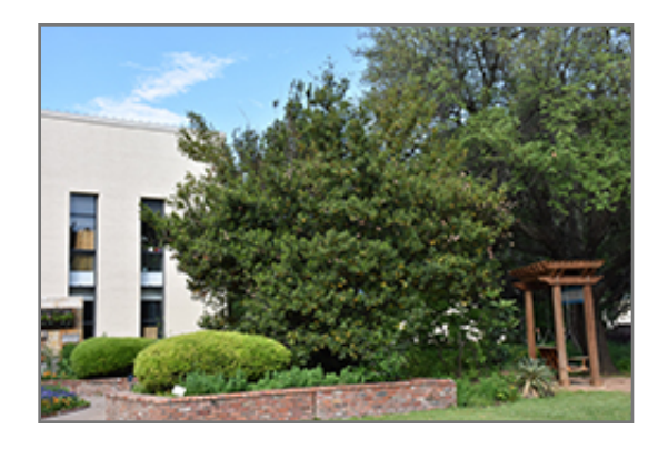
Bay Laurel

Bay Laurel is recommended for the following landscape applications;