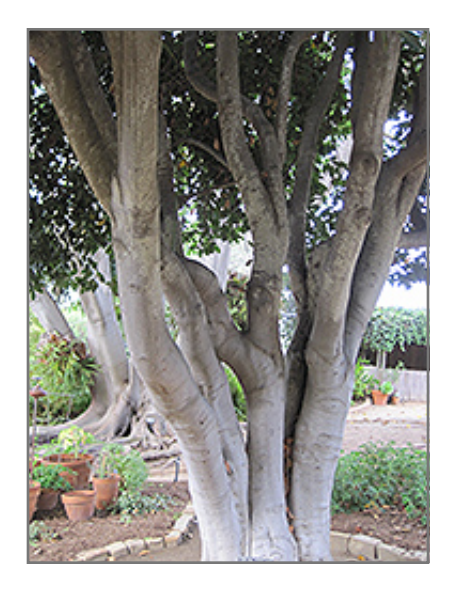
Bay Laurel bark

This tree does best in full sun to partial shade. It does best in average to evenly moist conditions, but will not tolerate standing water. It is not particular as to soil type or pH. It is somewhat tolerant of urban pollution. This species is not originally from North America. It can be propagated by cuttings.