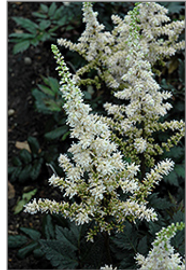
Visions in White Chinese Astilbe flowers