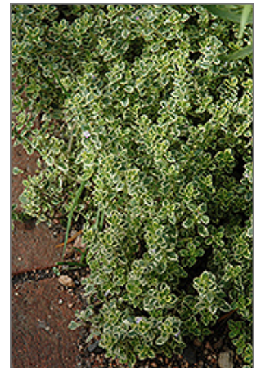
Aureus Lemon Thyme foliage