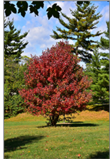
Redpointe Red Maple in fall

This tree should only be grown in full sunlight. It is quite adaptable, preferring to grow in average to wet conditions, and will even tolerate some standing water. It is not particular as to soil type, but has a definite preference for acidic soils, and is subject to chlorosis (yellowing) of the foliage in alkaline soils. It is somewhat tolerant of urban pollution. This is a selection of a native North American species.