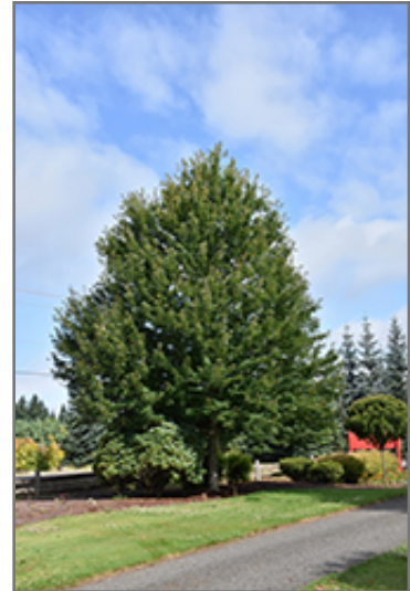
Redpointe Red Maple