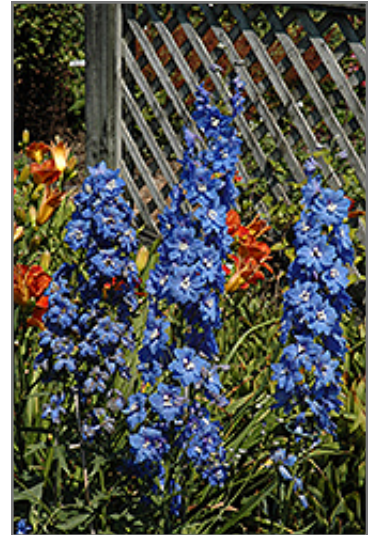
Cobalt Dreams Larkspur flowers