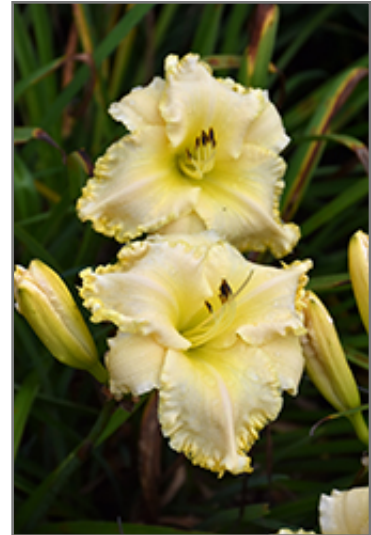
Marquee Moon Daylily flowers