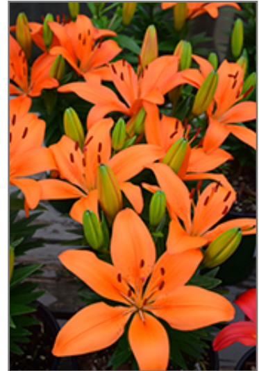
Matrix Orange Lily flowers