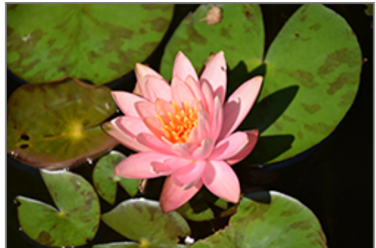
Colorado Hardy Water Lily flowers