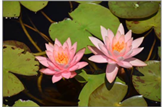
Colorado Hardy Water Lily flowers

Colorado Hardy Water Lily is ideally suited for growing in a pond, water garden or patio water container, and is recommended for the following landscape applications;