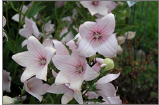
Astra Pink Balloon Flower flowers