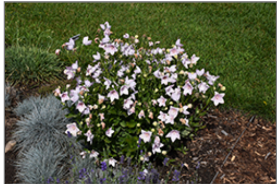
Astra Pink Balloon Flower in bloom