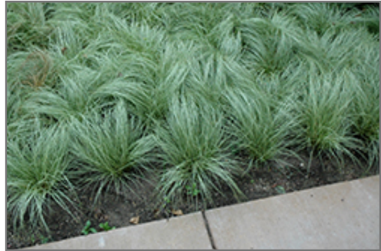
Amazon Mist Sedge