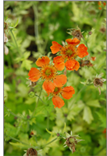
Sunkissed Lime Avens flowers

Sunkissed Lime Avens is recommended for the following landscape applications;