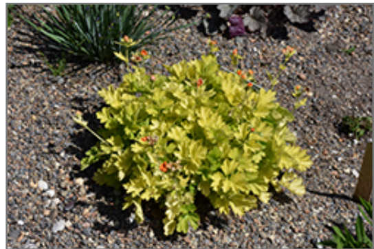
Sunkissed Lime Avens in bloom