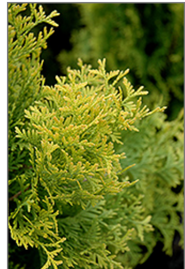
Amber Gold Arborvitae foliage