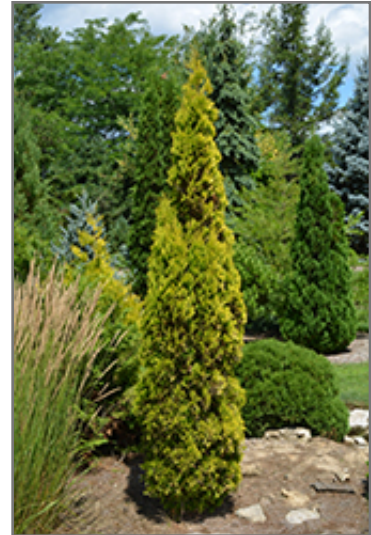
Amber Gold Arborvitae