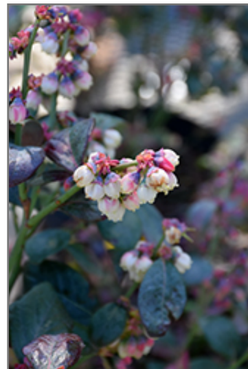
Pink Icing Blueberry flowers

This shrub is quite ornamental as well as edible, and is as much at home in a landscape or flower garden as it is in a designated edibles garden. It does best in full sun to partial shade. It does best in average to evenly moist conditions, but will not tolerate standing water. It is very fussy about its soil conditions and must have sandy, acidic soils to ensure success, and is subject to chlorosis (yellowing) of the foliage in alkaline soils. It is quite intolerant of urban pollution, therefore inner city or urban streetside plantings are best avoided, and will benefit from being planted in a relatively sheltered location. Consider applying a thick mulch around the root zone in winter to protect it in exposed locations or colder microclimates. This particular variety is an interspecific hybrid.