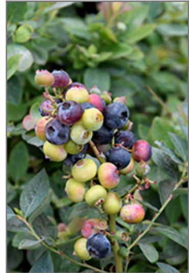
Pink Icing Blueberry fruit

Pink Icing Blueberry features dainty clusters of white bell-shaped flowers with shell pink overtones hanging below the branches in mid spring, which emerge from distinctive pink flower buds. It has bluish-green deciduous foliage which emerges pink in spring. The glossy oval leaves turn an outstanding aqua bluish-green in the fall. It features an abundance of magnificent blue berries in mid summer.