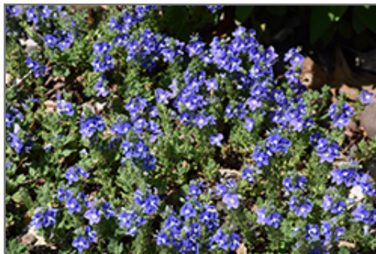
Tidal Pool Speedwell flowers

Tidal Pool Speedwell is recommended for the following landscape applications;