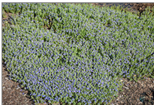
Tidal Pool Speedwell in bloom