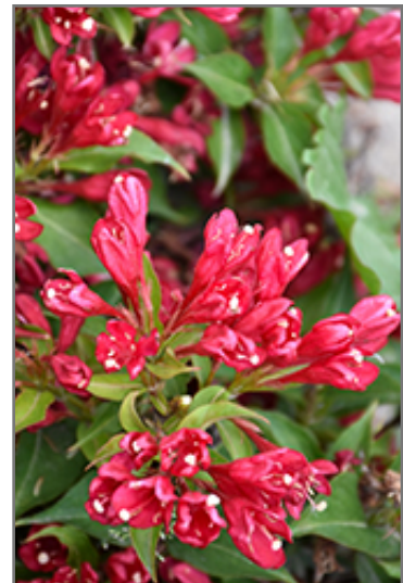
Crimson Kisses Weigela flowers