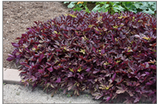
SolarPower Red Sweet Potato Vine