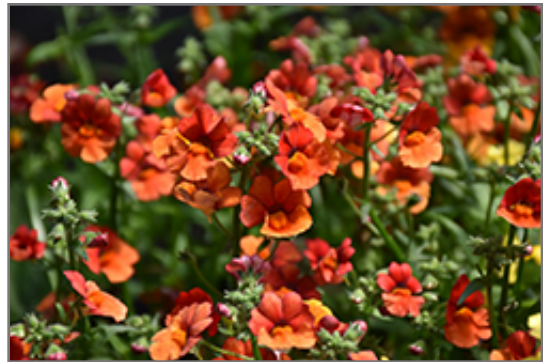
Sunsatia Blood Orange Nemesia flowers