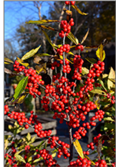
Winterberry fruit

Winterberry is recommended for the following landscape applications;