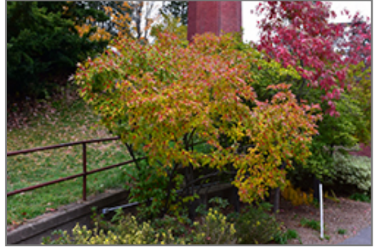
Winterberry in fall

This shrub does best in full sun to partial shade. It prefers to grow in moist to wet soil, and will even tolerate some standing water. It is very fussy about its soil conditions and must have rich, acidic soils to ensure success, and is subject to chlorosis (yellowing) of the foliage in alkaline soils. It is somewhat tolerant of urban pollution. Consider applying a thick mulch around the root zone in winter to protect it in exposed locations or colder microclimates. This species is native to parts of North America.