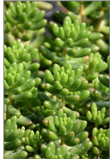
Jelly Bean Plant foliage

When grown indoors, Jelly Bean Plant can be expected to grow to be only 5 inches tall at maturity, with a spread of 14 inches. It grows at a medium rate, and under ideal conditions can be expected to live for approximately 10 years. This houseplant will do well in a location that gets either direct or indirect sunlight, although it will usually require a more brightly-lit environment than what artificial indoor lighting alone can provide. It prefers dry to average moisture levels with very well-drained soil, and may die if left in standing water for any length of time. This plant should be watered when the surface of the soil gets dry, and will need watering approximately once each week. Be aware that your particular watering schedule may vary depending on its location in the room, the pot size, plant size and other conditions; if in doubt, ask one of our experts in the store for advice. Like most succulents and cacti, it prefers to grow in poor soils and should therefore never be fertilized. It is not particular as to soil pH, but grows best in poor soil. Contact the store for specific recommendations on pre-mixed potting soil for this plant. Be warned that parts of this plant are known to be toxic to humans and animals, so special care should be exercised if growing it around children and pets.