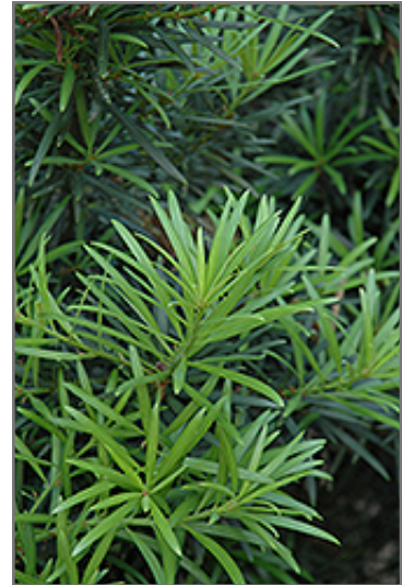
Japanese Yew foliage

When grown indoors, Japanese Yew can be expected to grow to be about 6 feet tall at maturity, with a spread of 3 feet. It grows at a slow rate, and under ideal conditions can be expected to live for approximately 50 years. This houseplant will do well in a location that gets either direct or indirect sunlight, although it will usually require a more brightly-lit environment than what artificial indoor lighting alone can provide. It does best in average to evenly moist soil, but will not tolerate standing water. The surface of the soil shouldn't be allowed to dry out completely, and so you should expect to water this plant once and possibly even twice each week. Be aware that your particular watering schedule may vary depending on its location in the room, the pot size, plant size and other conditions; if in doubt, ask one of our experts in the store for advice. It is not particular as to soil type or pH; an average potting soil should work just fine.