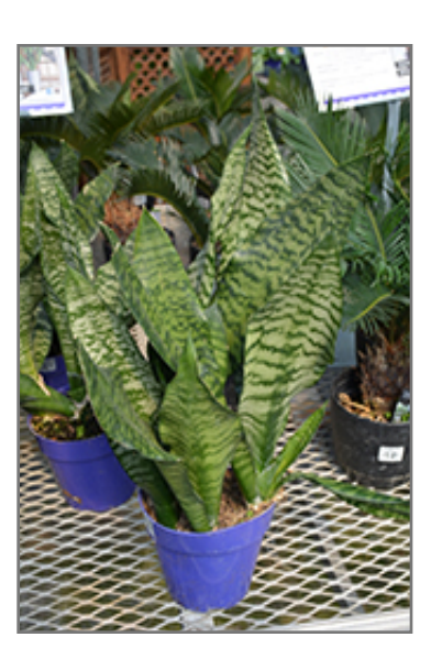
Futura Robusta Snake Plant

When grown indoors, Futura Robusta Snake Plant can be expected to grow to be about 24 inches tall at maturity, with a spread of 12 inches. It grows at a slow rate, and under ideal conditions can be expected to live for approximately 10 years. This houseplant performs well in both bright or indirect sunlight and strong artificial light, and can therefore be situated in almost any well-lit room or location. It is very adaptable to both dry and moist soil, and should do just fine under average home conditions. The surface of the soil shouldn't be allowed to dry out completely, and so you should expect to water this plant once and possibly even twice each week. Be aware that your particular watering schedule may vary depending on its location in the room, the pot size, plant size and other conditions; if in doubt, ask one of our experts in the store for advice. It is not particular as to soil pH, but grows best in sandy soil. Contact the store for specific recommendations on pre-mixed potting soil for this plant.