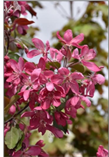
Royal Mist Flowering Crab flowers