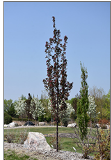
Royal Mist Flowering Crab in bloom