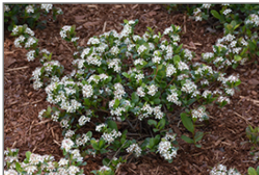
Low Scape Mound Aronia in bloom