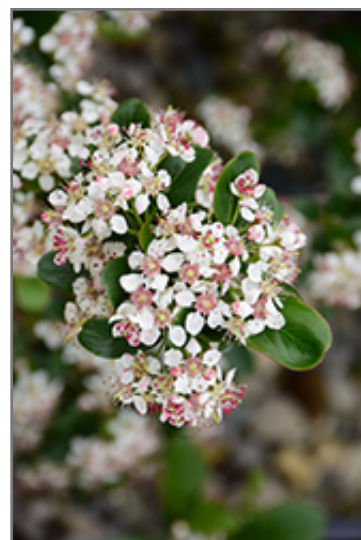
Low Scape Mound Aronia flowers