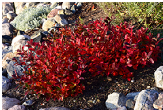
Low Scape Mound Aronia in fall

Low Scape Mound Aronia makes a fine choice for the outdoor landscape, but it is also well-suited for use in outdoor pots and containers. It can be used either as 'filler' or as a 'thriller' in the 'spiller-thriller-filler' container combination, depending on the height and form of the other plants used in the container planting. It is even sizeable enough that it can be grown alone in a suitable container. Note that when grown in a container, it may not perform exactly as indicated on the tag - this is to be expected. Also note that when growing plants in outdoor containers and baskets, they may require more frequent waterings than they would in the yard or garden.