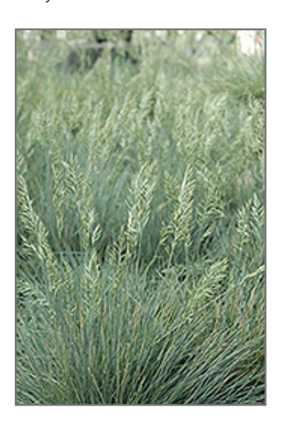
Elijah Blue Fescue foliage