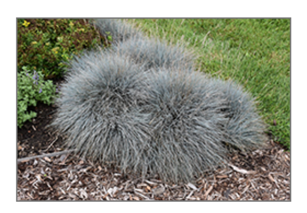
Elijah Blue Fescue

This plant does best in full sun to partial shade. It prefers to grow in average to dry locations, and dislikes excessive moisture. It is considered to be drought-tolerant, and thus makes an ideal choice for a low-water garden or xeriscape application. It is not particular as to soil type or pH. It is highly tolerant of urban pollution and will even thrive in inner city environments. This is a selected variety of a species not originally from North America. It can be propagated by division; however, as a cultivated variety, be aware that it may be subject to certain restrictions or prohibitions on propagation.