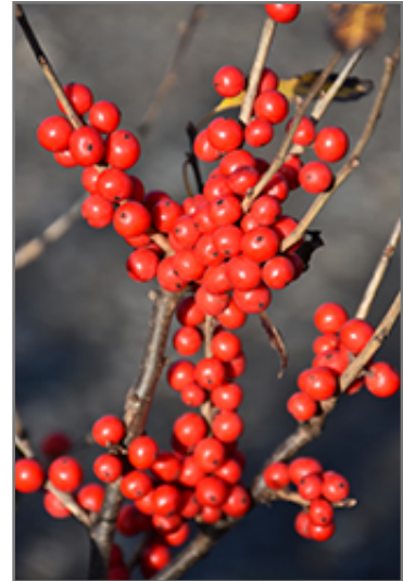
Berry Poppins Winterberry fruit