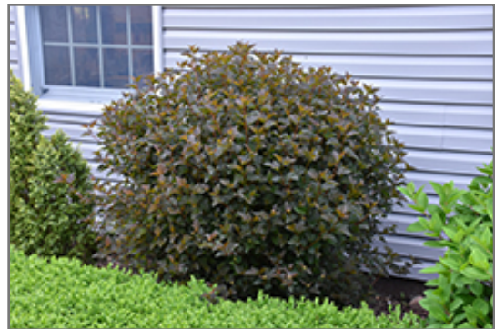
Ginger Wine Ninebark