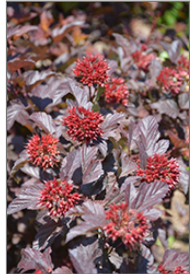
Ginger Wine Ninebark flower buds

This is a relatively low maintenance shrub, and can be pruned at anytime. It has no significant negative characteristics.