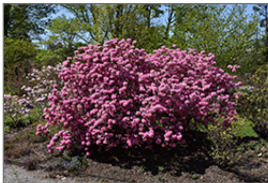
Weston's Aglo Rhododendron in bloom