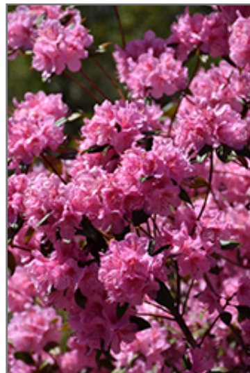
Weston's Aglo Rhododendron flowers