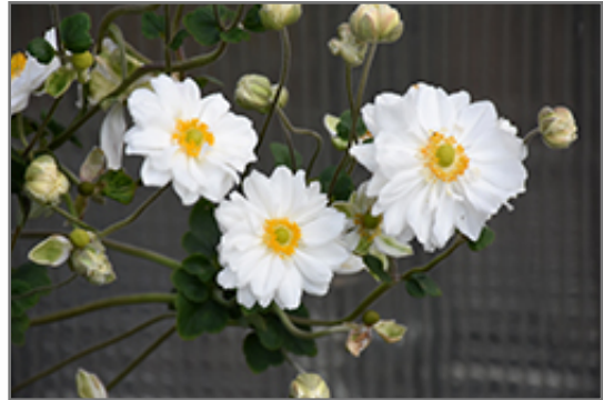
Whirlwind Anemone flowers