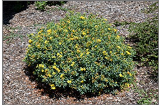
Cobalt-n-Gold St. John's Wort in bloom

Cobalt-n-Gold St. John's Wort is recommended for the following landscape applications;