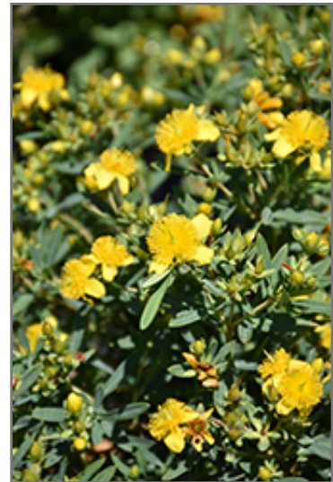
Cobalt-n-Gold St. John's Wort flowers