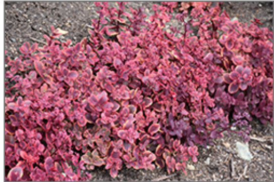
Sunsparkler Wildfire Stonecrop