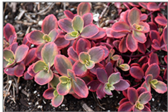
Sunsparkler Wildfire Stonecrop foliage