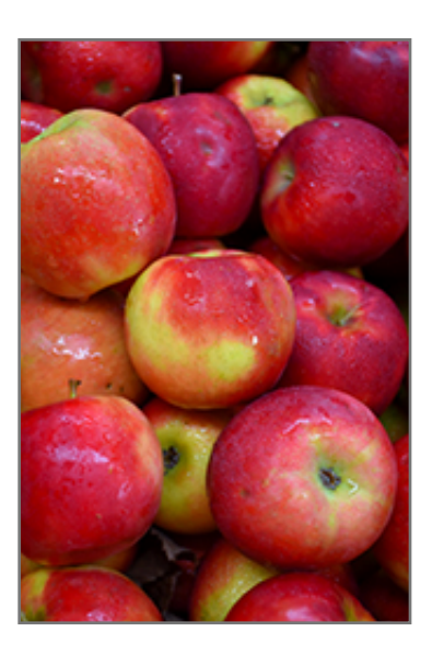
Crimson Crisp Apple fruit