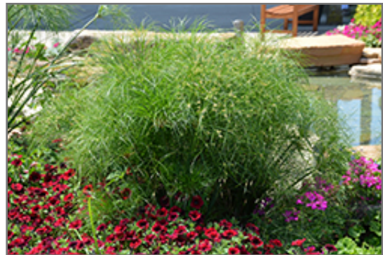
Prince Tut Egyptian Papyrus