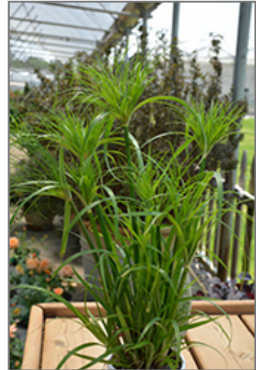
Prince Tut Egyptian Papyrus