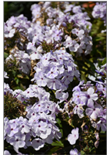
Flame Blue Garden Phlox flowers