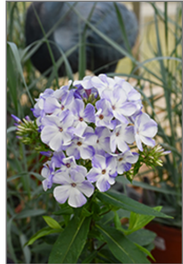
Flame Blue Garden Phlox flowers

Flame Blue Garden Phlox is a fine choice for the garden, but it is also a good selection for planting in outdoor pots and containers. It is often used as a 'filler' in the 'spiller-thriller-filler' container combination, providing a mass of flowers against which the larger thriller plants stand out. Note that when growing plants in outdoor containers and baskets, they may require more frequent waterings than they would in the yard or garden.