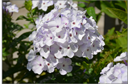
Flame Blue Garden Phlox flowers

Flame Blue Garden Phlox is a dense herbaceous perennial with an upright spreading habit of growth. Its medium texture blends into the garden, but can always be balanced by a couple of finer or coarser plants for an effective composition.