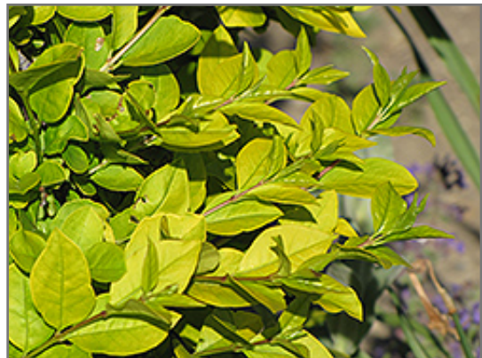
Golden Privet foliage