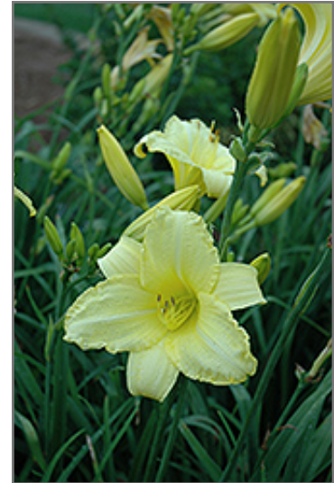
Happy Ever Appster Happy Returns Daylily flowers

Happy Ever Appster Happy Returns Daylily is recommended for the following landscape applications;