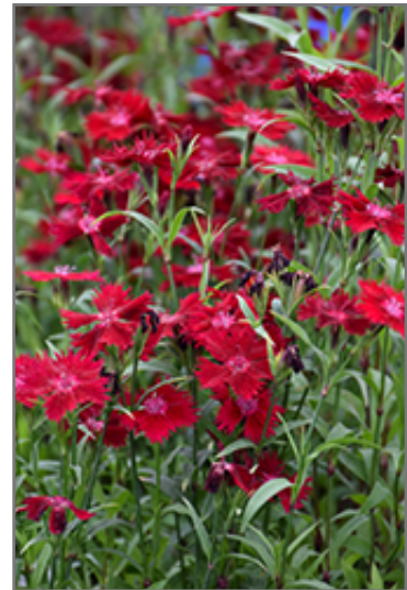
Rockin' Red Pinks flowers