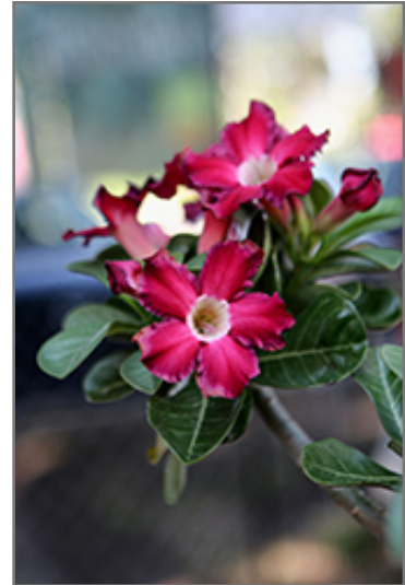
Desert Rose flowers