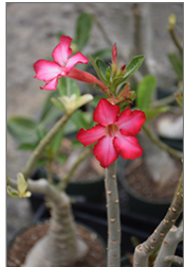
Desert Rose flowers