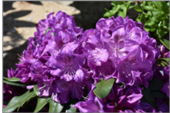
Florence Parks Rhododendron flowers

Florence Parks Rhododendron will grow to be about 6 feet tall at maturity, with a spread of 6 feet. It tends to be a little leggy, with a typical clearance of 1 foot from the ground, and is suitable for planting under power lines. It grows at a slow rate, and under ideal conditions can be expected to live for 40 years or more.