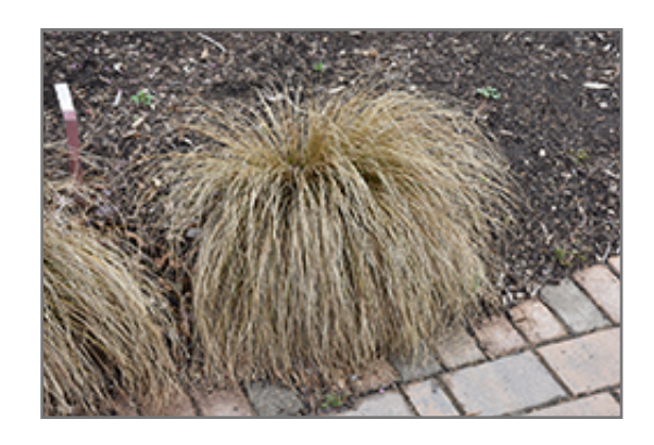
Prairie Fire Sedge

Prairie Fire Sedge is recommended for the following landscape applications;