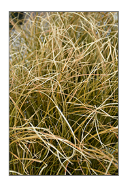
Prairie Fire Sedge foliage