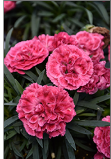
Fruit Punch Raspberry Ruffles Pinks flowers

Fruit Punch Raspberry Ruffles Pinks is recommended for the following landscape applications;