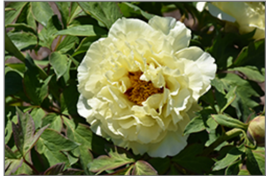
High Noon Tree Peony flowers

High Noon Tree Peony will grow to be about 5 feet tall at maturity, with a spread of 4 feet. It has a low canopy, and is suitable for planting under power lines. It grows at a slow rate, and under ideal conditions can be expected to live for approximately 20 years.