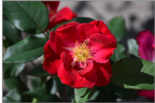
Top Gun Rose flowers