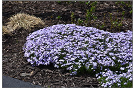
Spring Blue Moss Phlox in bloom