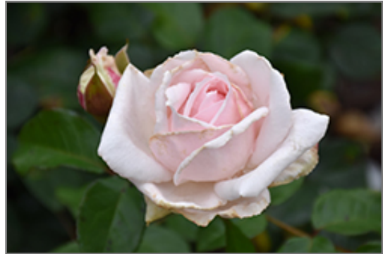
First Crush Rose flowers