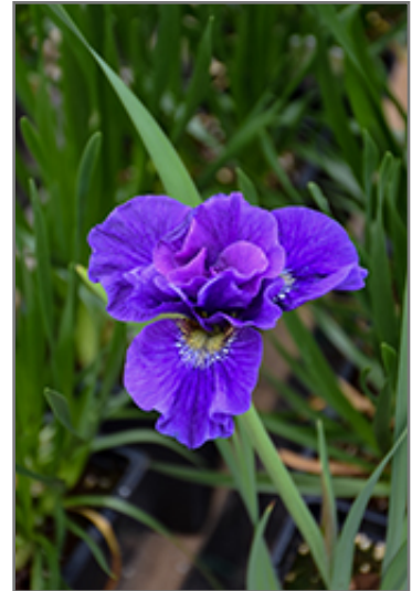
Concord Crush Siberian Iris flowers