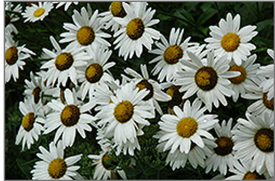
Alaska Shasta Daisy flowers

Alaska Shasta Daisy has masses of beautiful white daisy flowers with yellow eyes at the ends of the stems from early to late summer, which are most effective when planted in groupings. The flowers are excellent for cutting. Its serrated narrow leaves remain dark green in colour throughout the season.