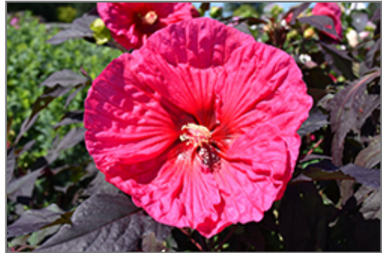
Summerific Evening Rose Hibiscus flowers

Summerific Evening Rose Hibiscus is recommended for the following landscape applications;