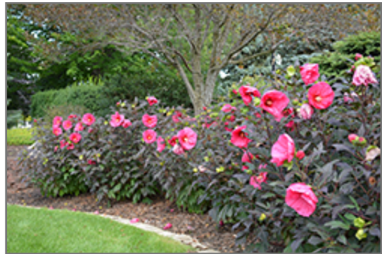
Summerific Evening Rose Hibiscus in bloom