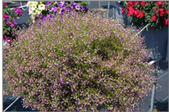
Pink Shimmer Cuphea in bloom

Pink Shimmer Cuphea is a fine choice for the garden, but it is also a good selection for planting in outdoor pots and containers. It is often used as a 'filler' in the 'spiller-thriller-filler' container combination, providing a mass of flowers against which the thriller plants stand out. Note that when growing plants in outdoor containers and baskets, they may require more frequent waterings than they would in the yard or garden.