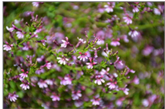
Pink Shimmer Cuphea flowers